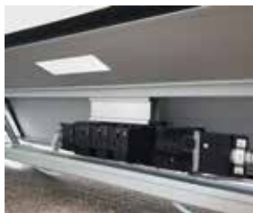
Sapphire Wall System Electric Raceway -Open