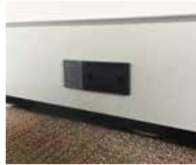
Sapphire System Data Raceway -Closed