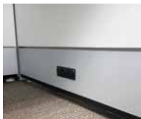
Sapphire Wall System Electric Raceway -Closed