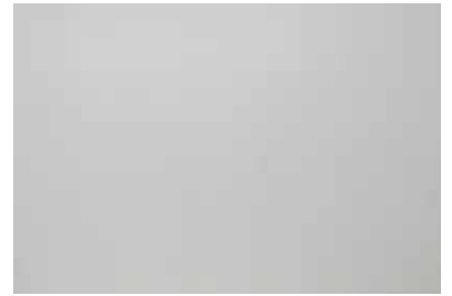
Light Gray (XD-01)