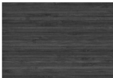
Asian Night (WA7949)