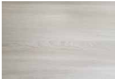
Sea Salt (XD-1026)