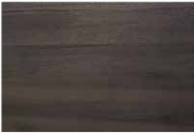
Black Oak (XD-1025)