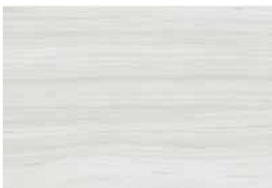
White Cypress (WA-7976)