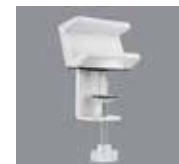
Clamp-on Power Strip Holder