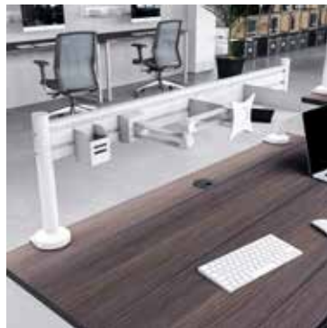
Single Sided Slat Wall