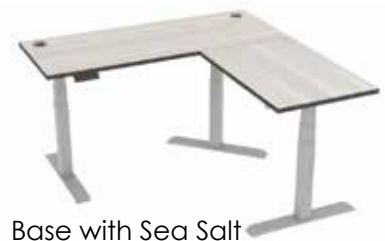
Base with Sea Salt Laminate Top