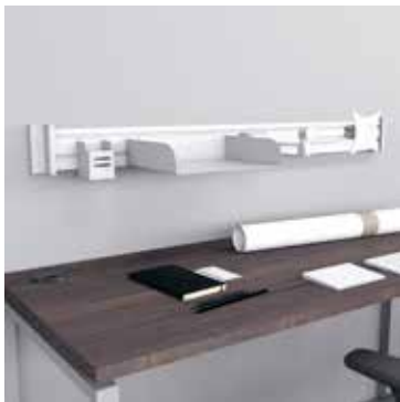
Wall Mounted Slat Wall