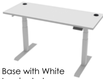
Base with White Laminate top