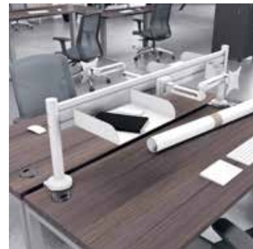
Double Sided Slat Wall