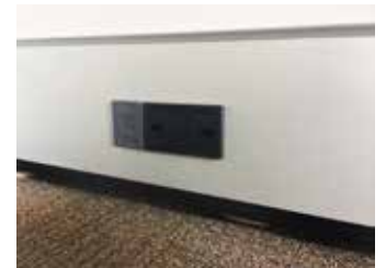
Sapphire System Data Raceway -Closed