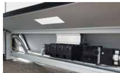
Sapphire System Electric Raceway -Open