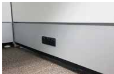
Sapphire System Electric Raceway -Closed