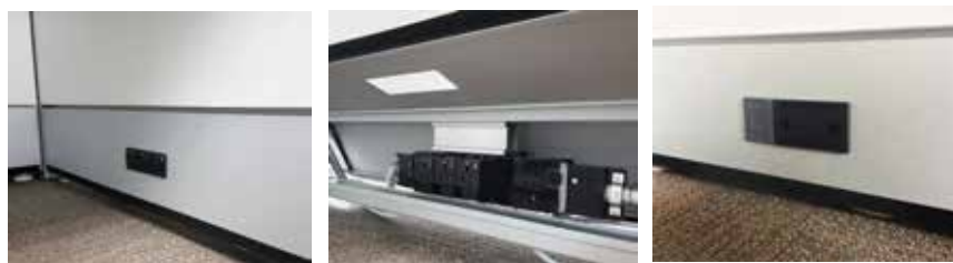
Sapphire Wall System Electric Raceway -Closed